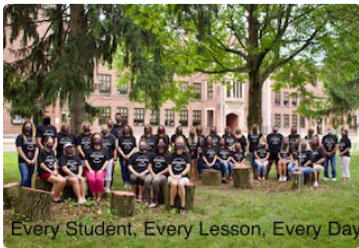
Every Student, Every Lesson, Every Day